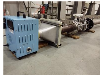
Figure 6: The pipeline connection when ultrasonic flowmeter used.