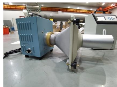
Figure 7: The pipeline connection when special orifice flowmeter used.

Special orifice flowmeter is based on differential pressure principle, because of its simple structure, easy to carry, so widely used in atmospheric environment flow measurement[5]. The specially machined orifice flowmeter can be directly connected to the sampler's filter holder, as shown in Figure 7, making it easy to measure the air sampler's flow rate.