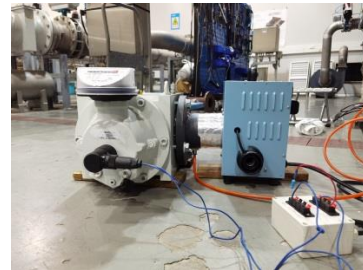
Figure 5: The pipeline connection when roots flowmeter used.

The roots flowmeter and ultrasonic flowmeter all have the characteristics of high precision, good reliability, the difference is roots flowmeter is less affected by installation conditions, on the contrary, ultrasonic flowmeters are susceptible to flow field in pipes. Therefore, when we use roots flowmeter to test the air sampler, we can directly connect it to the air sampler, without the need for straight pipe section. The pipe connection is shown in Figure 5. Similarly, when using ultrasonic flow, we need to install a straight section of sufficient length in front and behind the flowmeter to meet its requirements, as shown in Figure 6.