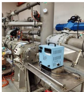
Figure 4: The pipeline connection.

When we test with this standard facilities, we can use the fan on the unit as the power source, since the sampler comes with a sampling pump, we can also use it to provide power. The pipeline connection during the test is shown in Figure 4. We conducted the test under two different installation conditions, namely the filter paper installed and no filter paper installed at the air sampler inlet.