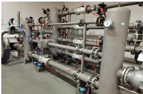
Figure 3: Gas flow standard facilities by master method.

Gas flow standard facilities by master method is the most commonly used gas flow standard facilities, it is composed of gas roots flowmeter, gas turbine flowmeter, temperature transmitter, pressure transmitter and so on. Figure 3 shows the gas flow standard facilities used in this paper, with measurement range (0.5\sim 7500)\text{m}^3/\text{h} , uncertainty of measurement is 0.30\%(k=2) . Other devices described below can also be traced to this standard facilities.