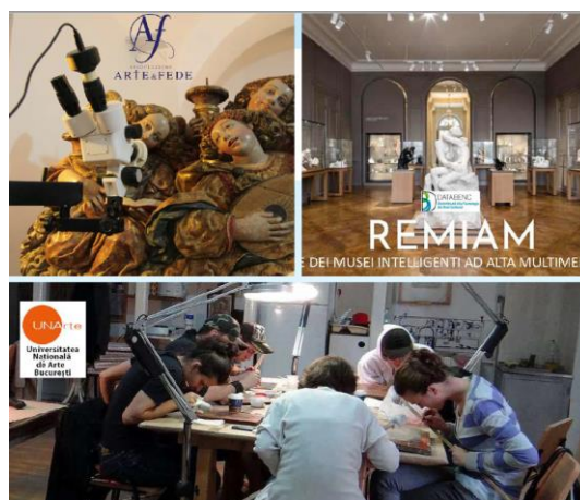
Fig. 4. "Arte e Fede" of Gerace (RC) restoration course.

During the planning of the project idea, the Expert determines the necessary resources, time schedule, methods and locations, and identifies the possible repercussions and impact on the territory in terms of economic, social and cultural development, also through the involvement of the reference communities.