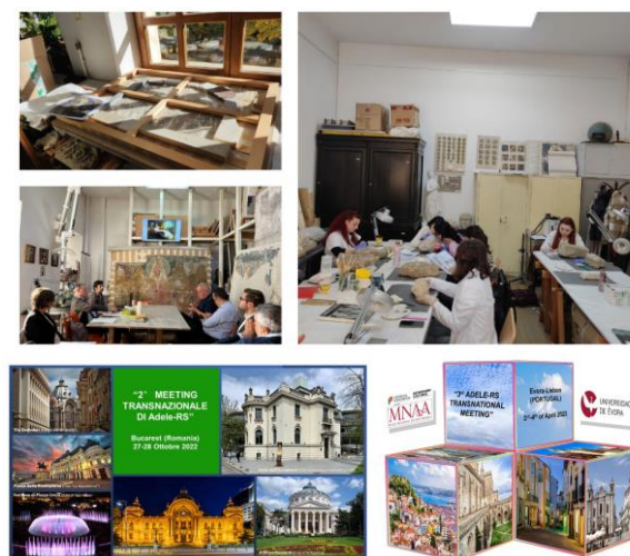
Fig. 5. Transnational meetings scheduled up to date into the ADELE project activities.

The results of ongoing Adele-RS Project are characterized by reusable, transferable, scalable and have a strong transdisciplinary dimension. Adele-RS Project, starting from the dialogue among different European institutes engaged in conservation and valorisation of cultural heritage during transnational meetings (Fig. 5), aims to support the development, transferring and/or implementation of innovative practices.