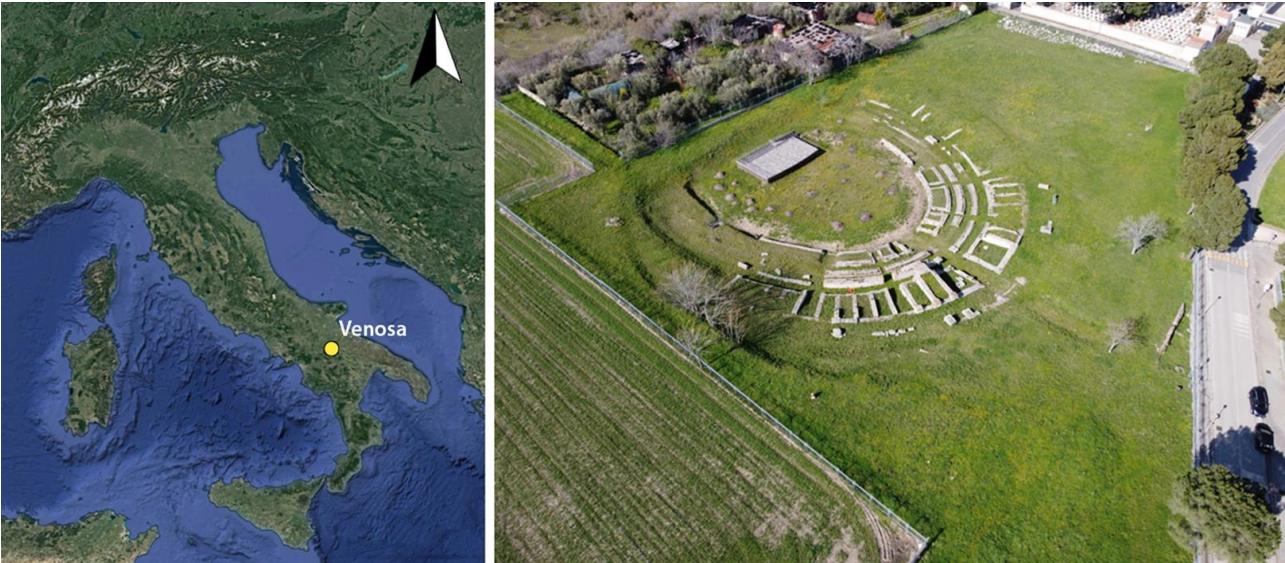
Fig. 1. Venosa: the archaeological site A - B