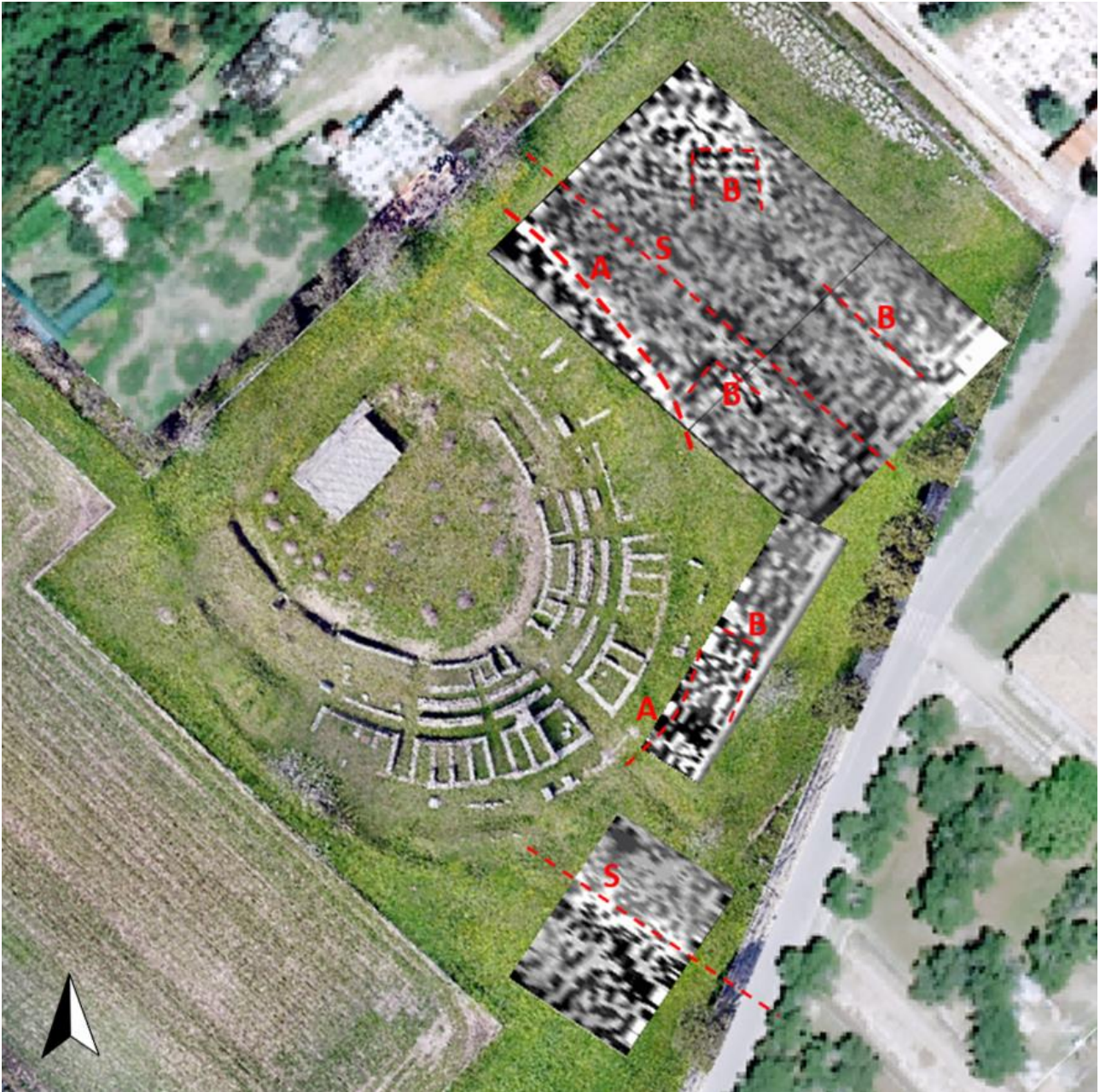
Fig. 4. Gradiometric map: A: amphitheater; B: walls; S: roads.