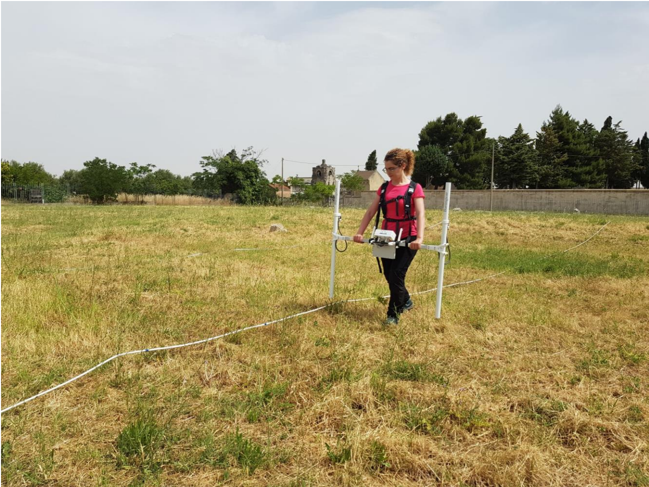
Fig. 2. Photo relating to the measurement phases with a magnetometer.