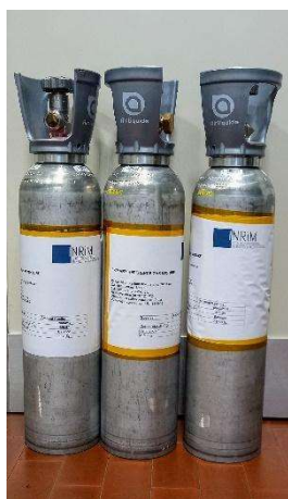
Figure 3: Examples of INRiM reference gas mixtures for CO 2 amount fraction and isotopic composition.

Transform Infrared Spectrometer - FTIR (Nicolet iS50, ThermoFisher Scientific, USA) equipped with a mercury cadmium telluride (MCT) detector and a 2 m White type gas cell. This reference gas mixture was sent to the Max Planck Institute for Biogeochemistry (MPI-BGC) for the verification of the isotopic composition by isotope-ratio mass spectrometry (IRMS) and the value was consistent with the one reported by INRiM, within the declared uncertainty. Figure 3 shows some of the cylinders which were analysed at MPI-BGC for the validation of their isotopic composition.